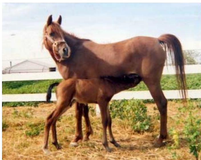
Two weeks old